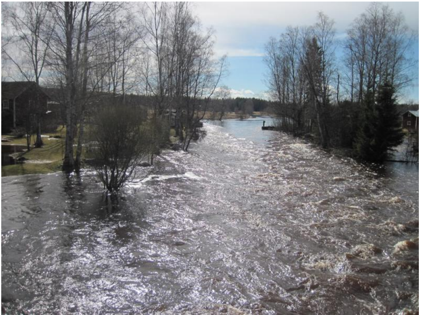
Figure 2. The spring floods at Vääräjoki.

Human activities have extensively modified hydrological and morphological conditions of the river in the past 150 years. Altogether, 25 km was channelized for flood protection and timber floating between the 1860s and late 1950s. From 1959-1974, Lake Evijärvi in the middle reaches of Vääräjoki was reclaimed for flood protection (Figure 2). Nine hundred ha of lake area were reclaimed by channelizing the river and by embankments. Especially flood protection measures changed the riffle areas considerably: The water retention capacity of the river bed decreased, and the heterogeneous flow patterns in riffle habitats disappeared.