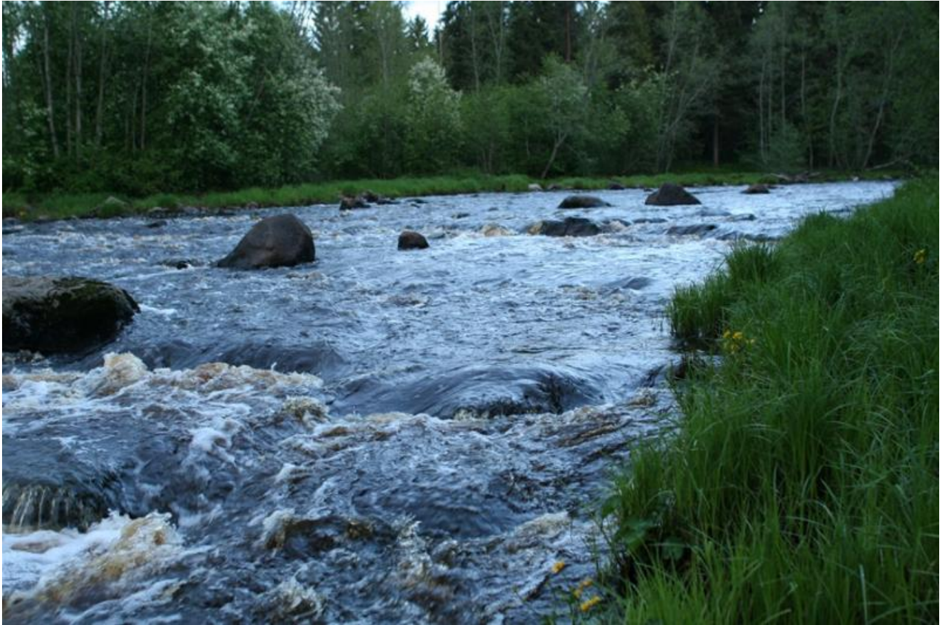
Figure 3. The restored riffle Niskakoski at Vääräjoki.

In 2013, there are plans to continue the restoration works at the upper and lower reaches of the river. The restoration plan for the upstream reach 35-86 km from the river mouth is ready, and the work is about to begin. The plan to restore the downstream part of the river 0-13 km from the river mouth is nearly finished.