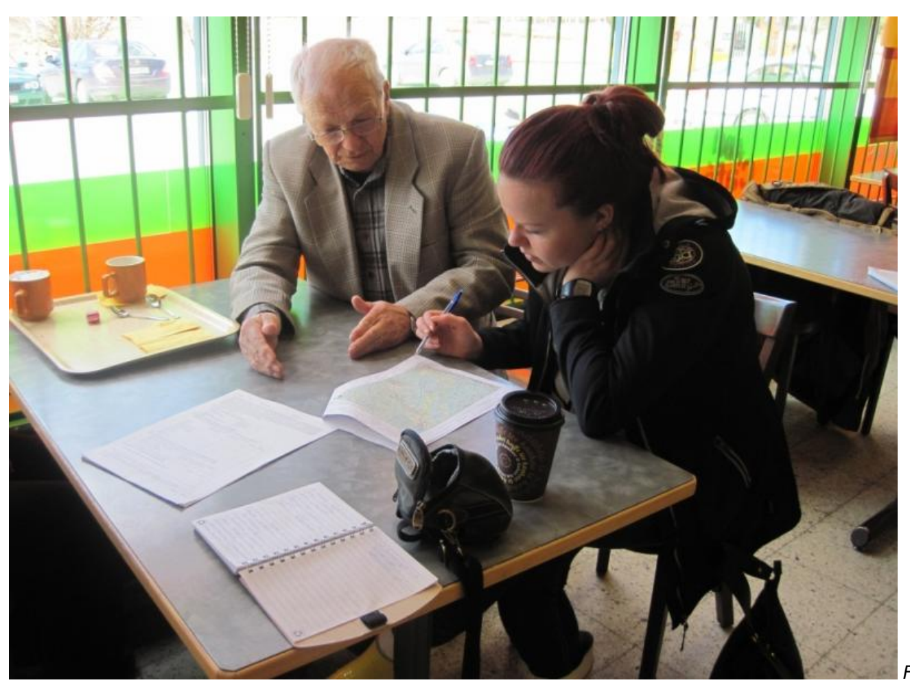
gure 4: Conducting the survey at local cafeteria in Sievi

Many of the older respondents remembered those days when the water was clearer and fish and crabs were more plentiful. On some occasions, the surveys turned more or less into small interviews, for example with an older couple living next to the river for over seventy years or a retired professor of ecology who could name and locate all endangered species living near the river. During their week of field work, Maarten and Tiina quickly gained "local fame" due to articles published in a local newspaper just a few days before the survey. This publicity positively influenced people's attitudes towards the research and enhanced their appreciation of the water courses near their home.